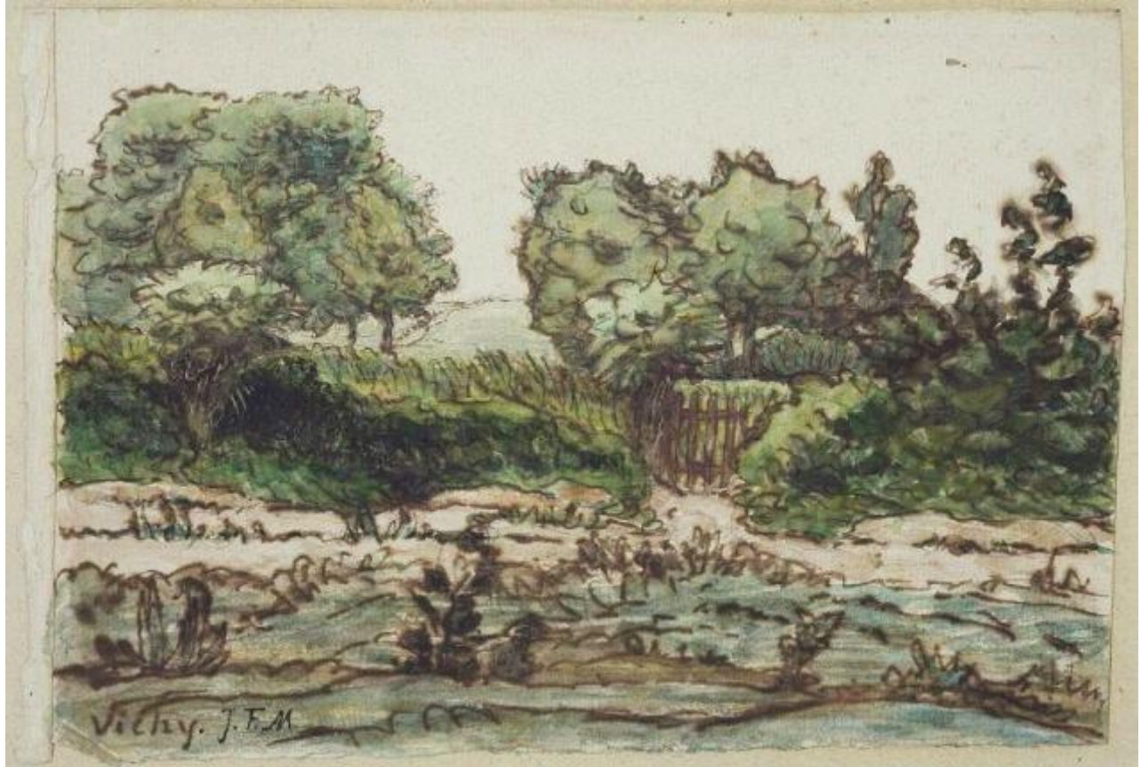
Jean-Francois Millet: Orchard Fence near Vichy

Watercolor is a medium that naturally flows, whereas ink is a medium used to depict precise contour lines. With the watercolor medium, it's tricky to create hard edges, unless you use the masking technique, as colors blend into one another. By using ink with watercolor, artists can create a contrast between the delicate, soft, hazy washes of the watercolor medium and the stark hard lines of ink.