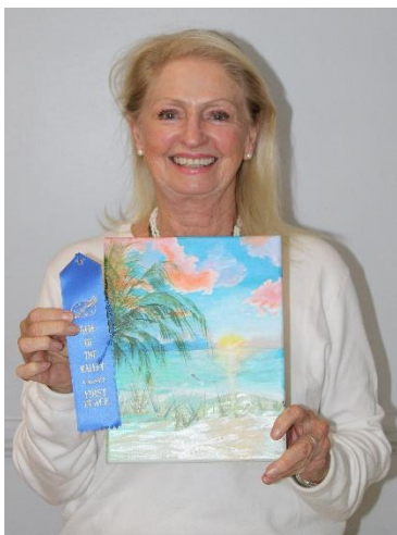
Gilly Jones "Beach With Sunset"