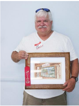
Steve Staudenmeir "Ghost Town Window"