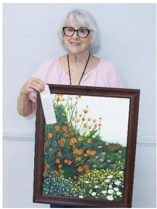
Peggy Botello "Flower Garden on Hill"